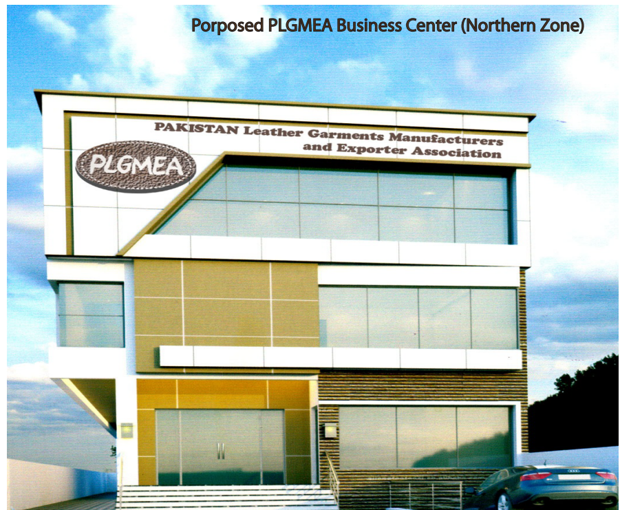
Proposed PLGMEA Business Center (Northern Zone)

🌐 www.plgmea.pk 📘 www.facebook.com/PLGMEA 📷 www.instagram.com/plgmea