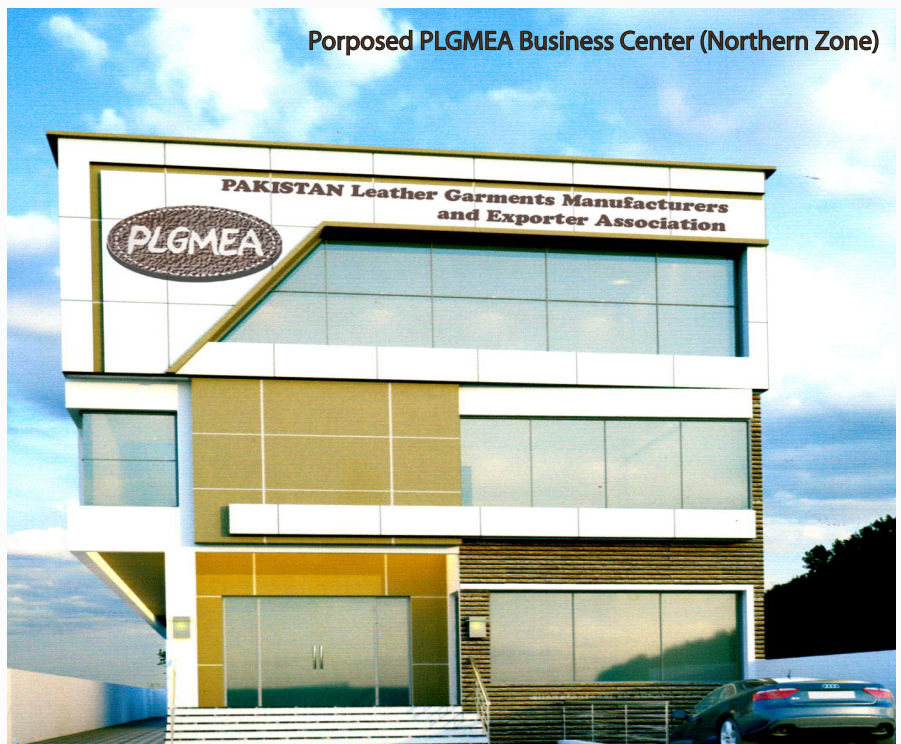
Proposed PLGMEA Business Center (Northern Zone)

🌐 www.plgmea.pk 📘 www.facebook.com/PLGMEA 📷 www.instagram.com/plgmea